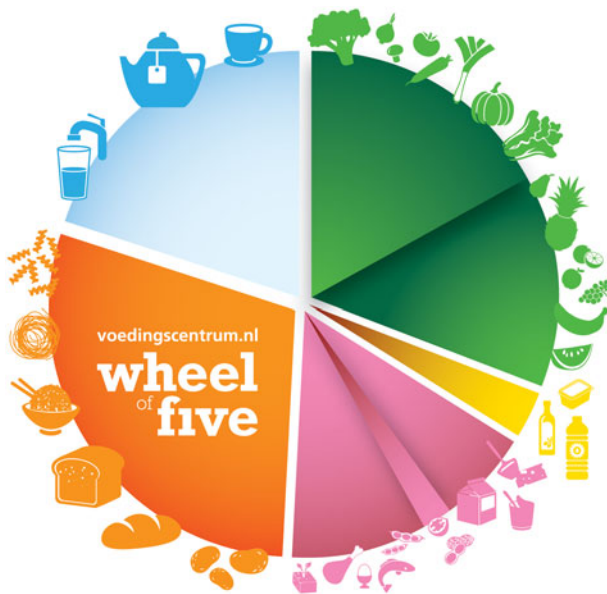
Fig. 2 Wheel of Five: graphical representation of the food-based dietary guidelines for the Netherlands